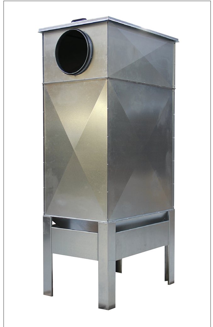
GFO – XT filter for Oil mist

Geovent Oil mist filters GFO and GFO XT need regeneration time, so the oil can drain. For continuous operation it is recommended to have 2 oil mist filters that change every 3 hours, depending on the load.