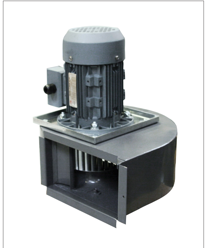
MSQ-200 fan - Effective spot extraction