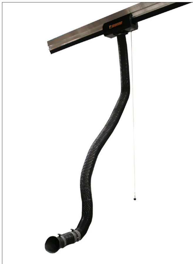
CERA Exhaust arm