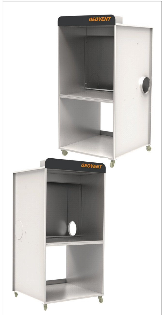
Spray booth for smaller items