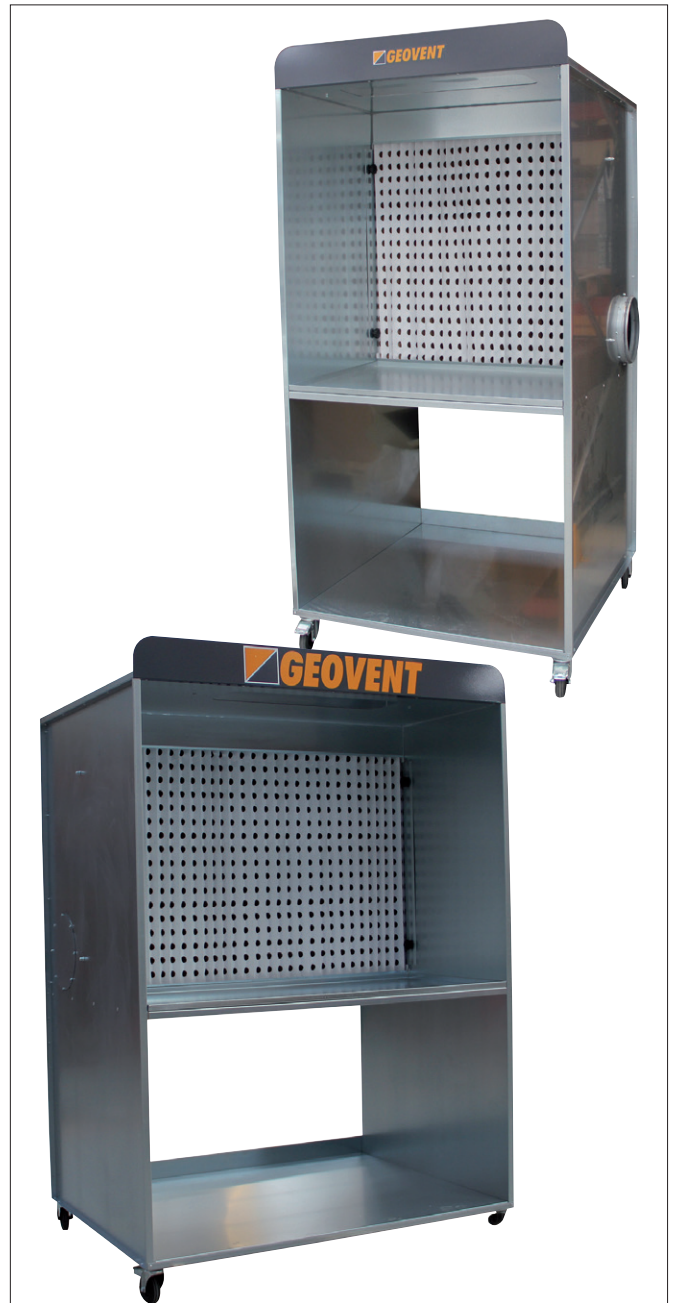
Spray booth for smaller items