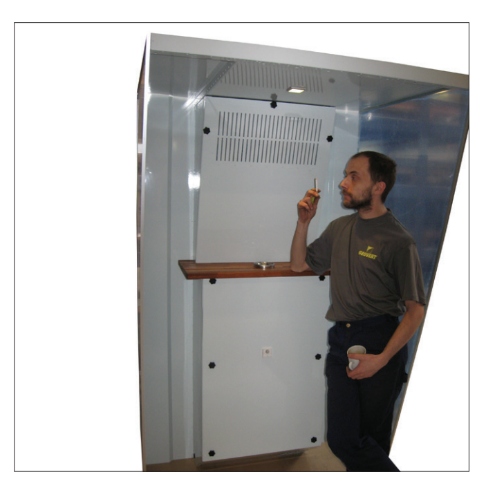
Effective smoking cabin with 99.9% filtration designed for use on ships