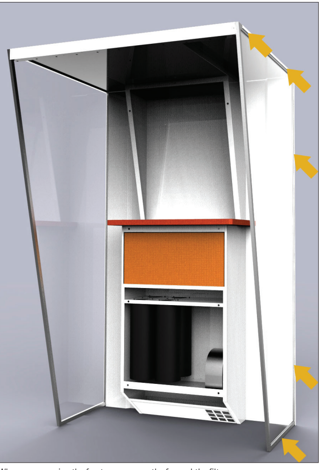
When you removing the front, you can see the fan and the filter.

The smoking cabin activated by an infrared sensor. The sensor detects the presence of people in the cabin, turn the fan on and off and lights when needed.