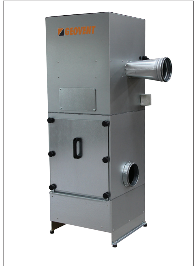
Dustbox with fan and manual compressed air cleaning.

Effective cleaning via compressed air with a one push button