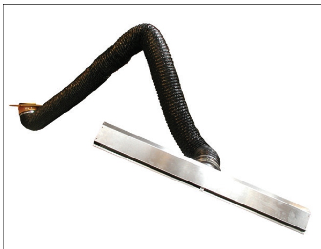
Panel fume extractor