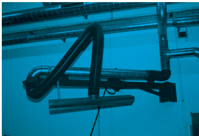
Panel fume extractor - mounted with wall bracket and connection.