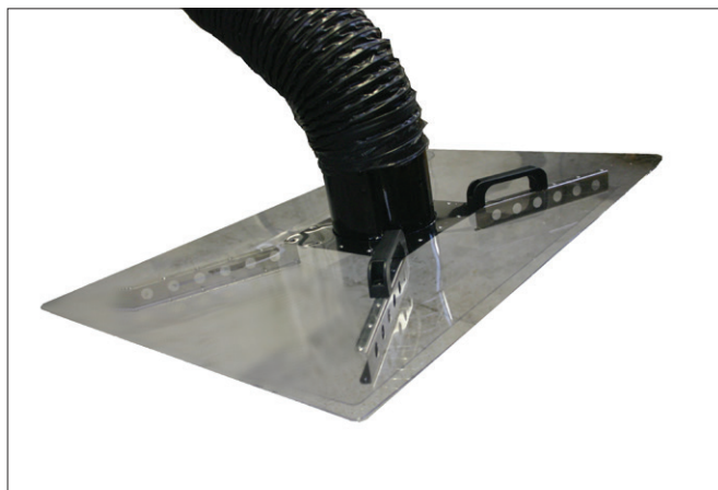
Extraction hood for windscreen gluing