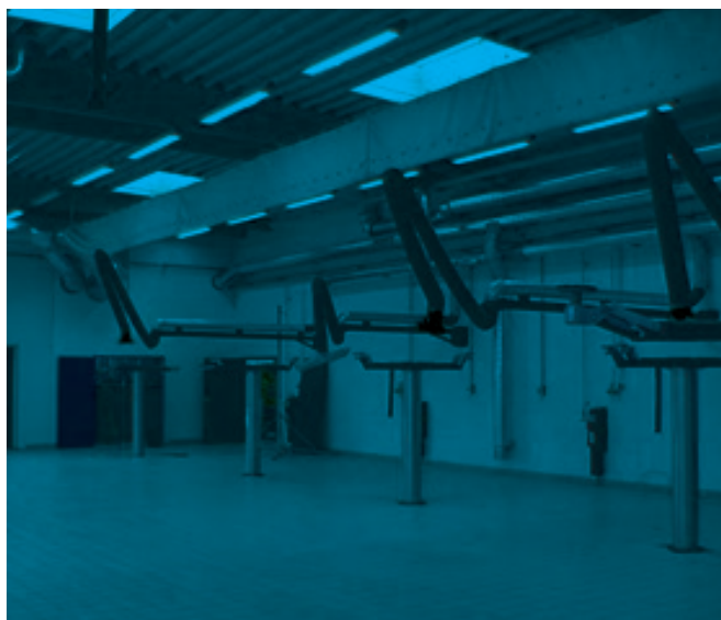
Workshop Environment with Panel fume extractor.